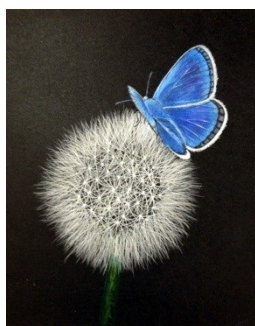
February 21 Wood/Masonite

Interested? Then check out our web site at www.villagepainters.net . The registration forms for the Learn to Paint classes can be found under Learn to Paint. Please join us and Learn to Paint! We look forward to painting with you.