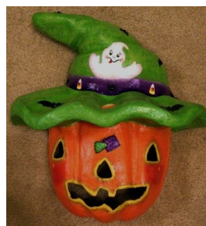
September 26 Papier Mache Mask