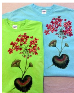
March 8 T-shirt